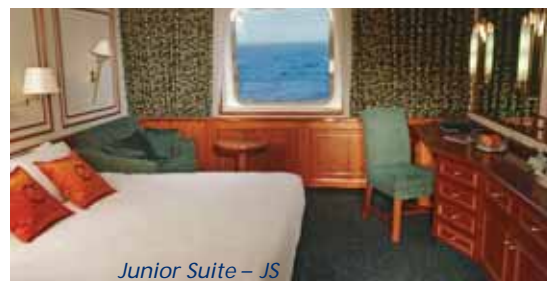
Junior Suite – JS