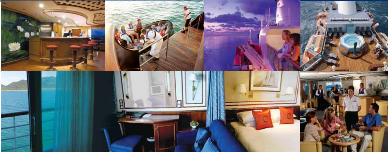
Chart your own path less travelled...

Although custom designed for expedition cruising, Orion is the epitome of elegance. Her luxurious appointments mean she is more mega-yacht than cruise ship and her guests are few; just 50 couples, all cared for in comfort by a crew of 75. Life on board Orion is relaxed and casually elegant. From gourmet dinner menus designed by Serge Dansereau of Sydney's 'The Bathers' Pavilion' fame, to pampering at the beauty salon, you will rediscover your capacity for relaxation and indulgence.