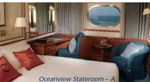
Oceanview Stateroom – A